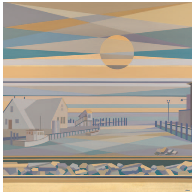
Martha's Vineyard Bound