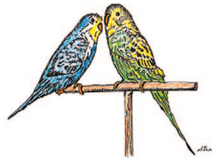
Bite Sized Treats – (above - Donna's answer to Covid lockdown, small ink and color drawings of the world around her)

stone walls or rock jetties with each individual stone built up by a painstaking application of small strips of tape to create polygonal images of rocks. "I love modeling the rocks," says Straw. "I was rock obsessed."