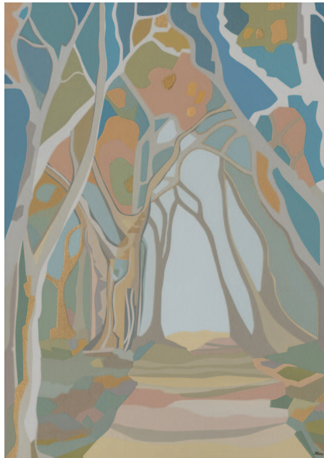
Into The Woods